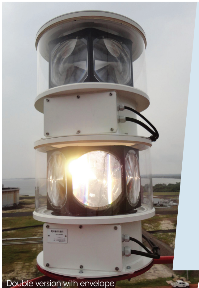
Double version with envelope

GISMAN rotating beacon GFT-200 is a revolving lantern intended for long range beaconing. This lantern is ideal for new lighthouses and for the refurbishment of existing equipment. It can achieve up to 25NM range @ 0.74T.